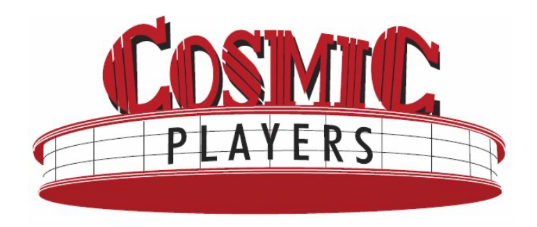
Cosmic Players Theatre Company image