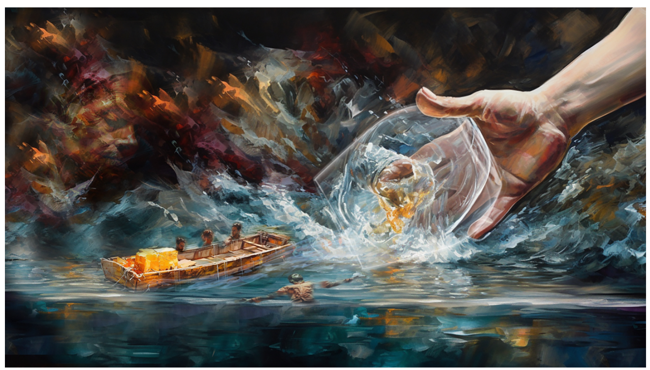
Broken River image